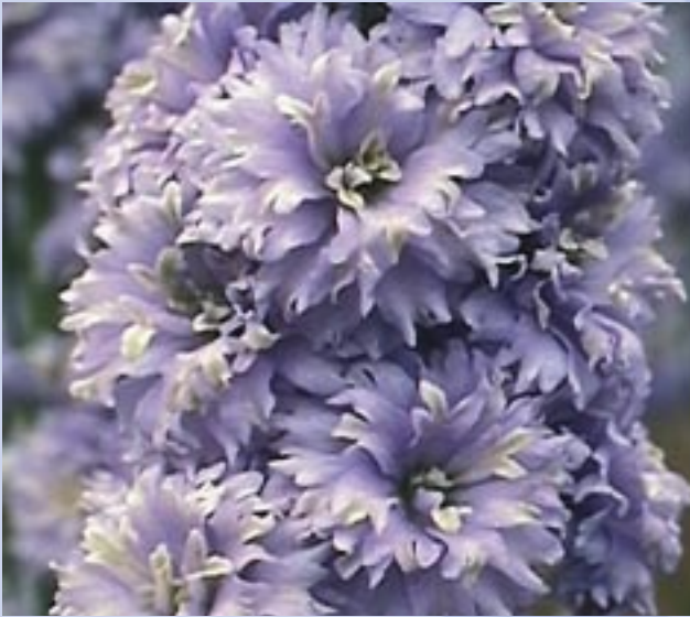
D. 'Susan Edmunds'

Some cultivars have double flowers with even more coloured bracts and often no clear distinction between sepals and petals, so that the flowers are eyeless. Such flowers may be sterile. (above)