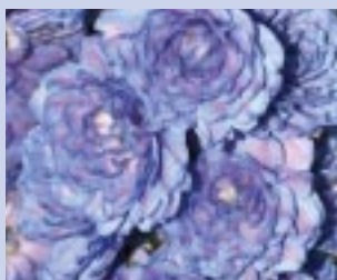
D. 'Liz Pelling'

A number of named delphiniums propagated from cuttings and protected by Plant Breeders' Rights are to undergo preliminary assessment by the Committee in 2004 as they are becoming increasingly available from garden centres. These include D. 'Coral Sunset', D. 'Darwin's Blue Indulgence', D. 'Darwin's Pink Indulgence', D. 'Delft Blue', D. 'La Bohème', D. 'Merel', D. 'Purple Ruffles', D. 'Sarita', D. 'West End Blue' and D. 'Wishful Thinking'.