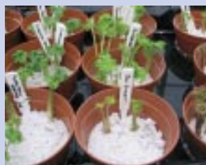
Cuttings in perlite